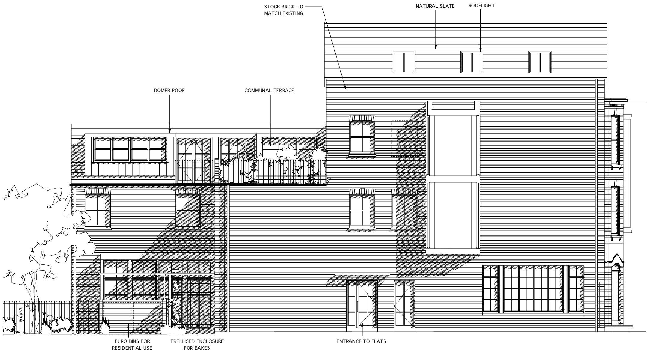
1 SOUTH - EAST ELEVATION 114 Scale 1:100